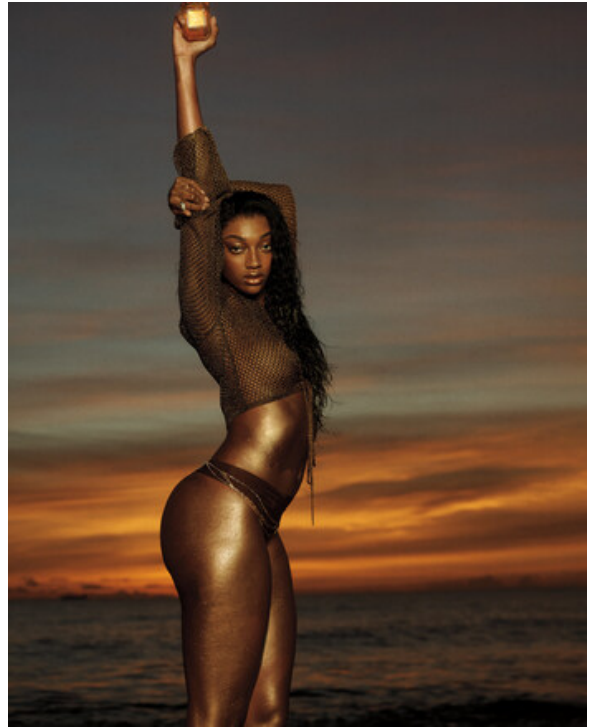
Angel Reese for Victoria's Secret