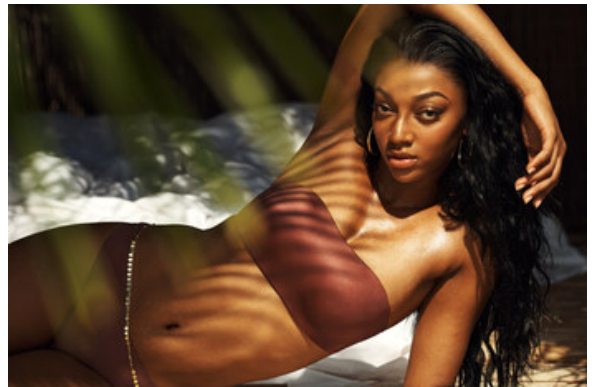
Angel Reese for Victoria's Secret

The collection introduces the Invisible by Victoria's Secret Strapless Collection, featuring an innovative and wear-tested, no-slip grip technology that provides a supportive, comfortable and reliable fit – complemented by the Summer Swim